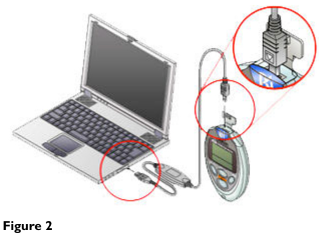
Omron enhanced pedometer system.

achieve minimum duration and intensity criteria. Goals were not necessarily monotonically increasing. For example, if a participant was sick, and thus had low step counts for one week, the subsequent weeks' goals might be lower than the goal for the week the participant was sick. The maximum allowable goal was 10,000 steps per day. If the calculated goals were greater than 10,000 steps per day, the goal was re-set at 10,000 steps per day.