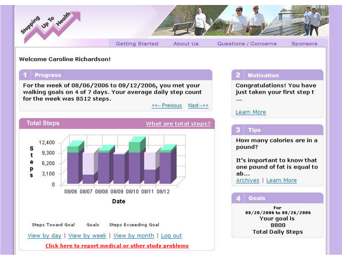
Figure I Screen shot from the Stepping Up to Health website.

Participants randomized to receive LG were instructed to focus on total accumulated steps. The algorithm for calculating LG involved averaging the previous seven days of total step data, adding 1,200 steps to the average, and then rounding off to the nearest 100 steps. LG group participants were encouraged to focus on bout steps. A computer program translated each individual's uploaded pedometer data into individualized step-count goals and feedback messages delivered through participants' personal Stepping Up to Health web page. Feedback about progress toward goals was displayed graphically and via text messages on the participants' web page. All graphs displayed total steps; success or failure in achieving goals was based only on total step counts. LG participants received credit for any and all walking during the day, even if they did not