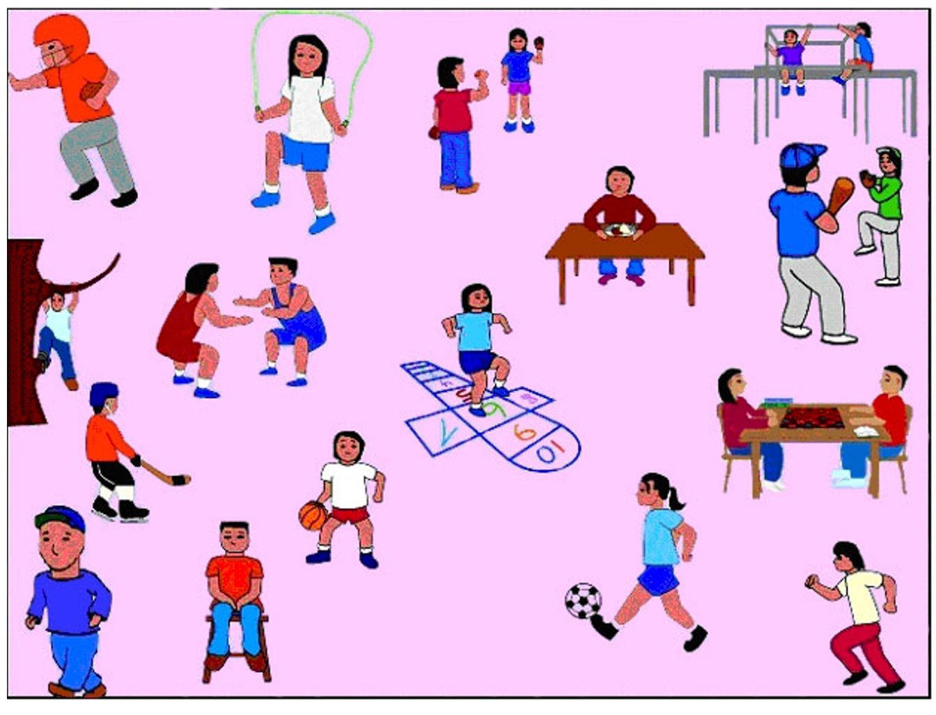
Figure 2 Activity response screen for recess in school day version of PAIR

growing red in the face. In response to the statement "This is how tired I got", the corresponding mouse roll-over for this icon is "very tired". These cyclist icons of varying intensity were used to depict activity intensity for all activity types. This pictorial scale has been shown to be useful for assessing perceived exertion during cycling [39] and more recently, validity evidence has been provided for the walk/run version of the scale [40].